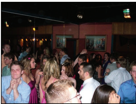
Delts dancing at the DTD Date Party which was the night before installation.