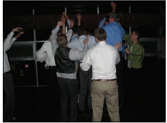
Delt's Dancing at the Delta Tau Delta Formal